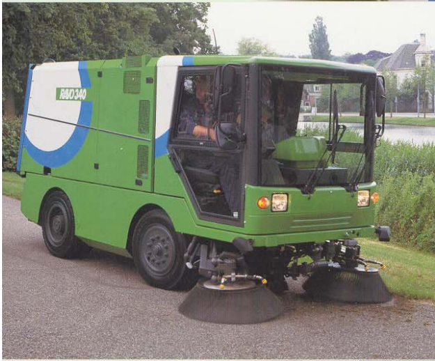
Optimal operation conditions