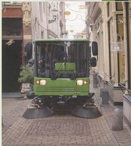
Sweeping at hard to reach places