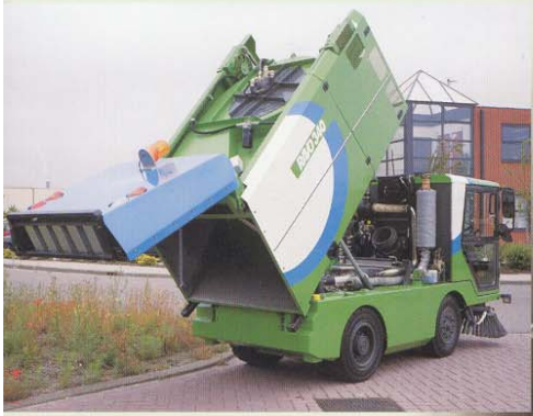
Tipping of the container